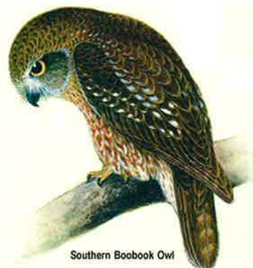
Southern Boobook Owl Illustration by Neville W. Cayley

FLORA - Trees - broad & narrow leaved ironbarks, brown bloodwoods, white box, river red gums, rough barked apples, white & black cypress pines, western scribbly gums. Shrubs - watties, heaths, casuarinas, pea bushes, hop bushes, daisy bushes, hakeas.