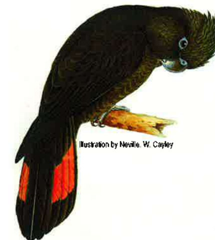
Illustration by Neville W. Cayley

A 5 km loop walk featuring 3 lookouts, a narrow gorge, many caves and lots of interesting plants. Allow 2 to 4 hours